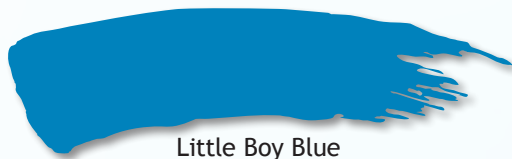
Little Boy Blue