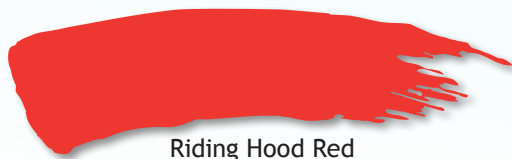
Riding Hood Red